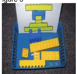
Figure 3 shows a product sample.