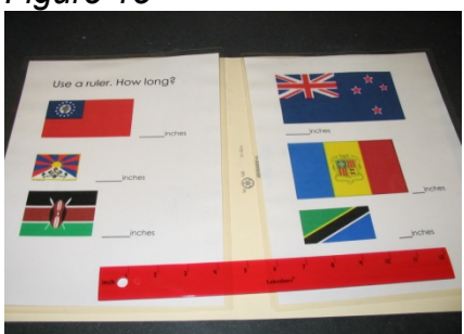
Figure 15 shows measuring activity using flags- a student interest.