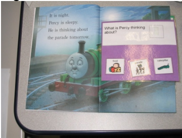
Figure 12 shows reading comprehension activity using Thomas the Train.