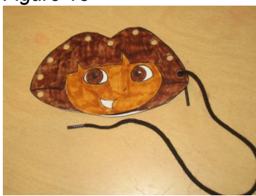
Figure 13 shows fine motor lacing activity incorporating Dora the Explorer