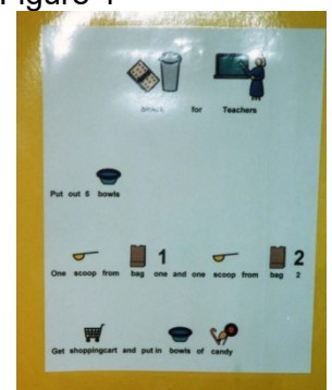
Figure 4 shows a written list with pictures.