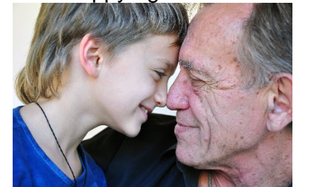
Happy again soon

I can think of the fun times I had with my special person. Soon I will feel better and be happy again. I know my special person will always love me and I will always love them. I will be OK!